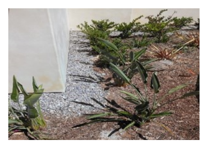
Mulch is pulled back at least 12 inches away from the structure.

Copyright © 2019, National Fire Protection Association. All rights reserved. Additional information on the Firewise USA<sup>®</sup> program can be obtained through the NFPA web site at <u>www.nfpa.org</u>.