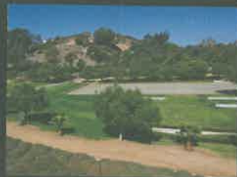
Ranch at the Coast • $3,500,000 Up to 22 Horses — Encinitas