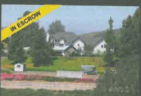
Home Is Where Your Horse Is $1,250,000 Amazing Trails, Rancho Santa Fe Schools