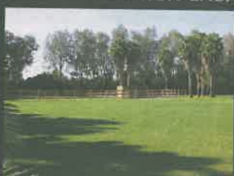
Privacy & Location • $1,350,000 2+ Acre Site in RSF — Many Horses Allowed