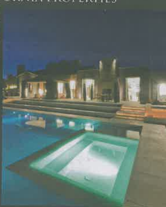
ULTRA COOL MODERN CLASSIC • Brand New Pricing!

Private estate offers 12,244 sq. ft. main residence plus detached guest house on 4.21 beautifully landscaped acres. The clean, contemporary design flawlessly integrates indoor and outdoor spaces, offering a calm, chic and elegant lifestyle. Now offered at $8,975,000. Additional 3.41 acre parcel is offered at $3,200,000. Call for details on equestrian potential. MLS # 120019048.