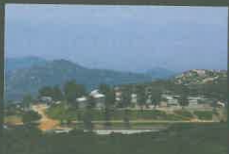
Ranch Lifestyle and Great Income $2,650,000 Residence, Views & 5% Return on Investment