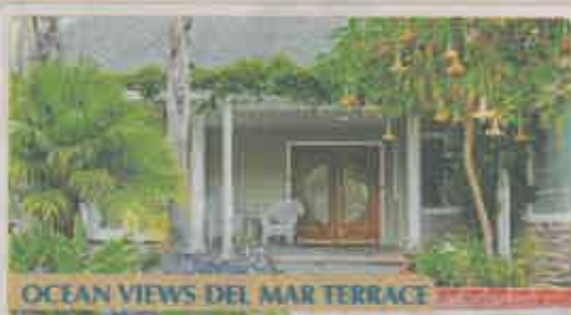
OCEAN VIEWS DEL MAR TERRACE

502 S. Rios Avenue, Solana Beach 4 BR/5 BA + accessory unit & studio, 4000 sq. ft., short walk to Cedros Design District-beach-Coaster, new flooring, designer paint, volume ceilings, swim pool, quarter acre lot flat-usable, $1,845,000 VRM.