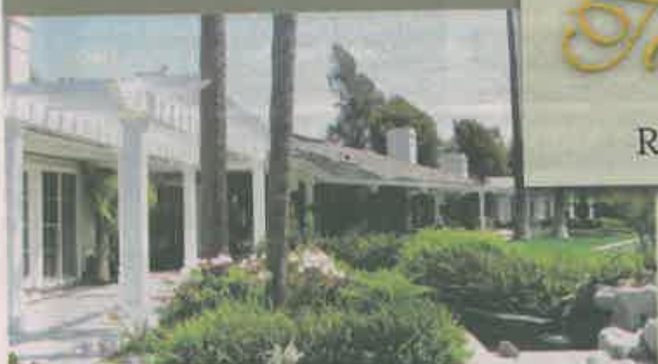
BEAUTIFUL 7,800 SQUARE FOOT ~ ONE STORY ESTATE SET ON PERFECTLY COIFFED GROUNDS.