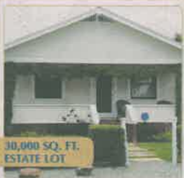
30,000 SQ. FT. ESTATE LOT

205 S. Helix #63, Solana Beach 2 BR/2.5 BA, oceanfront town home, 1800 sq. ft., Surf Song, recently updated in & out, dual MBR suites, 2 private decks, storage, rec area-pool & tennis courts, $1,295,000.