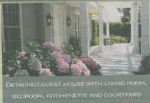
DETACHED GUEST HOUSE WITH LIVING ROOM, BEDROOM, KITCHENETTE AND COURTYARD