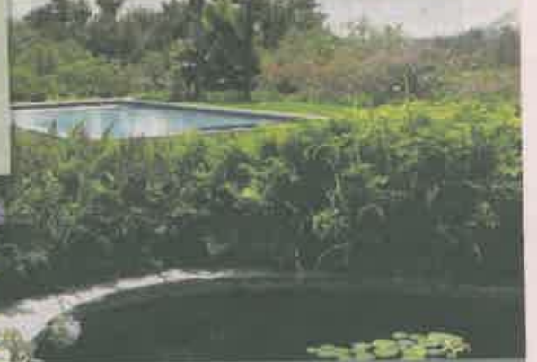
GLISTENING POOL WITH CASCADING 60' POND