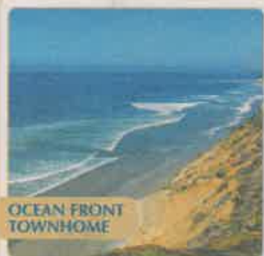
OCEAN FRONT TOWNHOME

806 N. Rios Avenue, Solana Beach 5 BR/ 5.5 BA + gym & huge bonus room, built 2000, Viking kitchen, granite, travertine, 1/3 acre privacy, pool/spa, outdoor fireplace/BBQ, 3 car garage, 6 blocks to beach! Only $1,950,000!