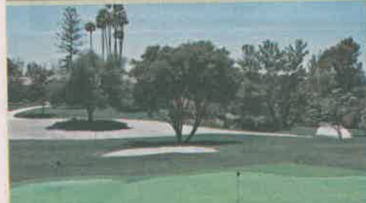
PRIVATE CHIPPING AND PUTTING GREEN