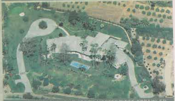
A TIMELESS, ONE STORY MASTERPIECE SPRAWLED ELEGANTLY ON 3 COVENANT ACRES