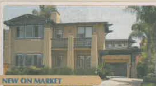
NEW ON MARKET

12740 Via Felino, Del Mar 3 BR/3.5 BA + sun room & gorgeous ocean view deck, 4000 sq. ft., walk to TP State Beach, 3 MBR suites, finest stones & materials, Chef's kitchen, granite, travertine, double lot, about $400/SF-WOW! Only $1,675,000!