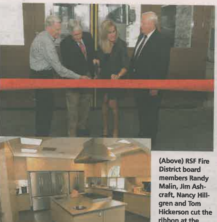
ribbon at the new Station 3. (Left) The kitchen