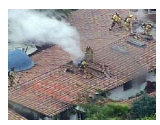
Related To Story