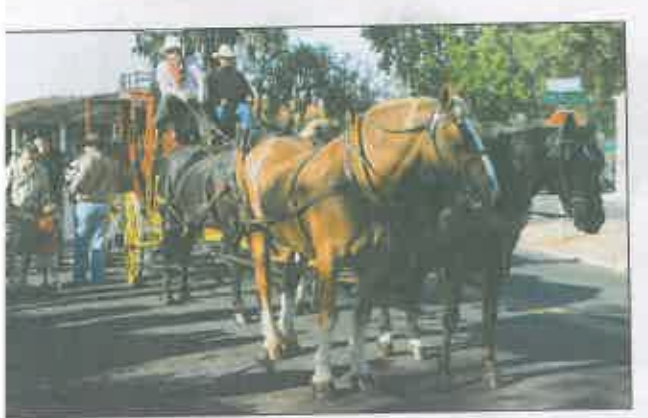
lancho Days (File photo).